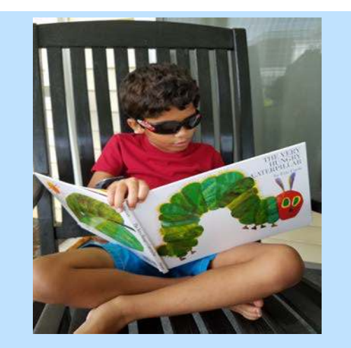
Countdown to Kindergarten getting children ready for school

*CTK program data is for June-August 2016, whereas CTK fiscal data includes expenditures from July 1, 2016 through June 30, 2017.